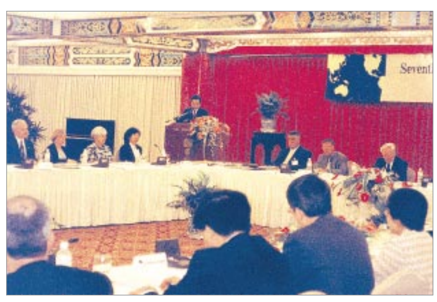
Opening address by Mr. Ruey-Long Chen, Vice Minister of Economic Affairs, Chinese Taipei

The Forum accepted the invitation of New Zealand to hold the 8<sup>th</sup> Forum meeting in New Zealand.