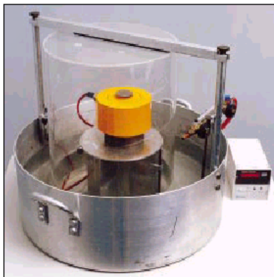
Figure B-2 The practical set-up